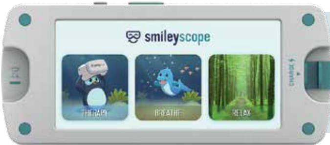
Program Selection screen