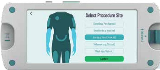
Procedure Site Selection screen