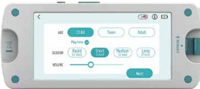
Session Selection screen